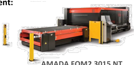
AMADA FOM2 3015 NT 4KW laser cuts 0.875" CRS 0.5" SS, 0.375" Al