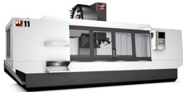
HAAS VF11 120" x 42" x 35" table