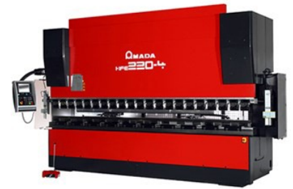
AMADA EMK 3610NT 600 ton press brake, bends up to 23'